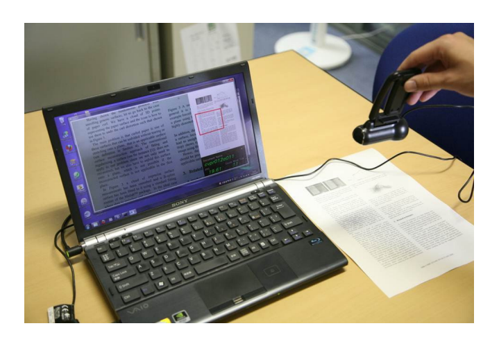
Figure 1. A scene of real-time demo system.