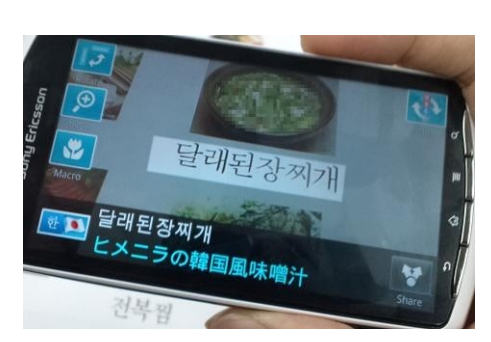
Application for the food menu translation

The developed portable system locally extracts and recognizes multilingual scene texts in real-time. The target language and text types are generic though, the demonstration is tuned to local menu translation for which the system combines multiple language processing based on WFST and an existing OCR engine for traditional Chinese, simplified Chinese, Korean, English, and Japanese.